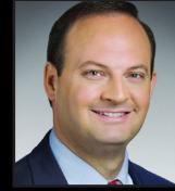
ALAN WILSON REPUBLICAN